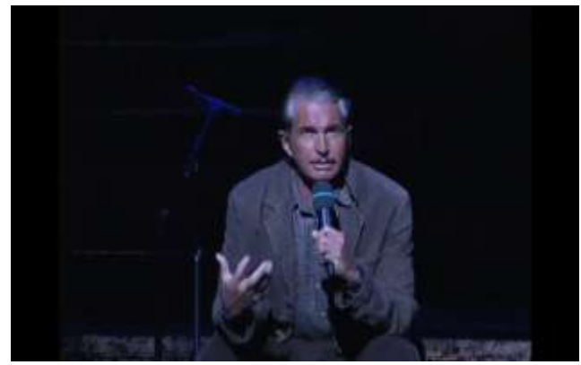
George Hamilton, Broadway and Film Actor, speaks at a Chicago Day on Broadway